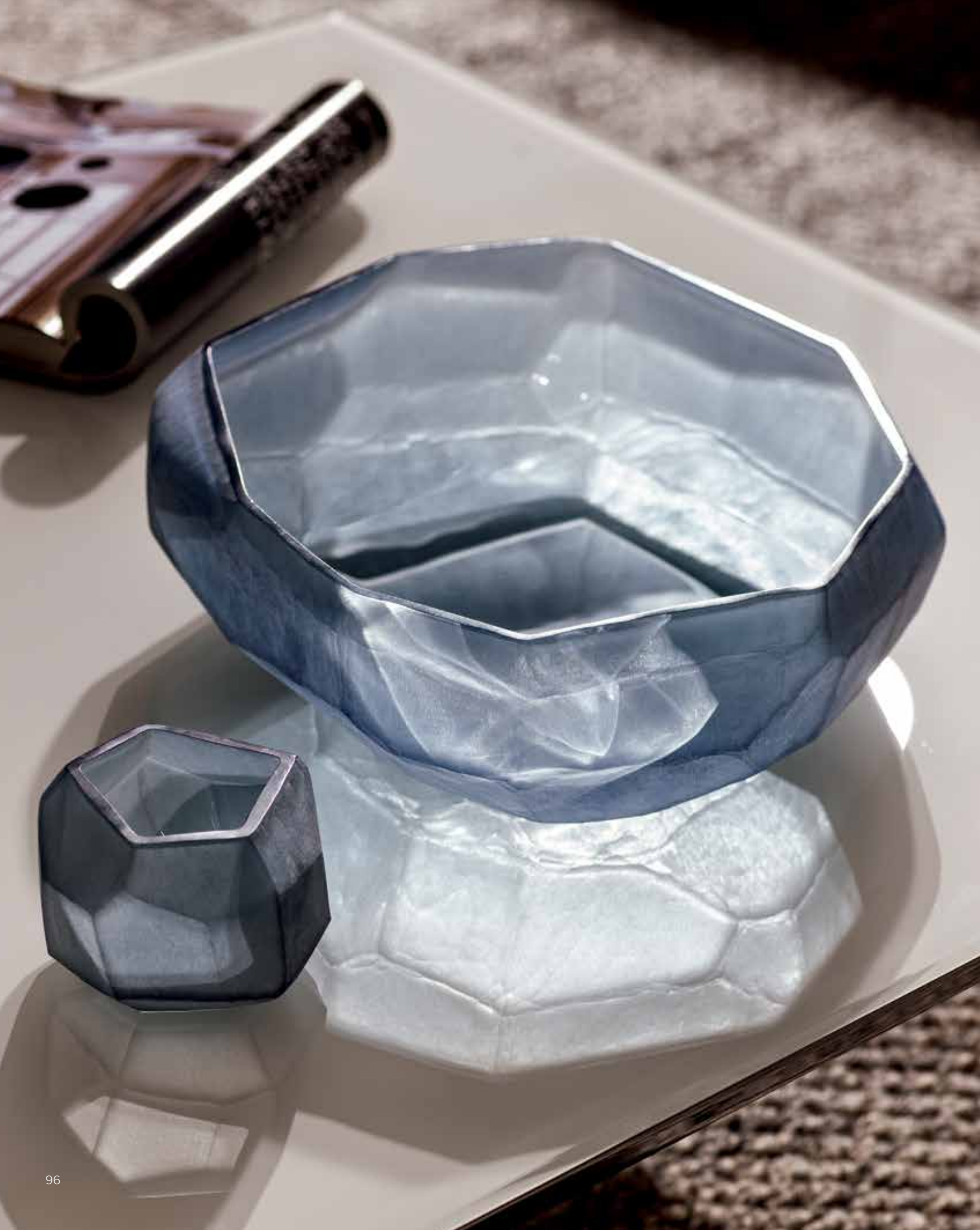
Photo in the previous page: Armonia sofa with chaise longue in mix leather and fabric. Cabaret table. Giasone rug. Liz chair.

Photo in this page: Cabaret central table detail, on top Cubistic glass bowl.