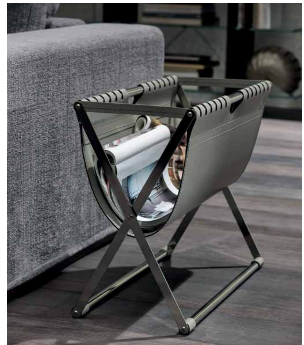
Photo in the previous page: Domino modular sofa in fabric. Proxima bookcase. Cosmo floor lamp.