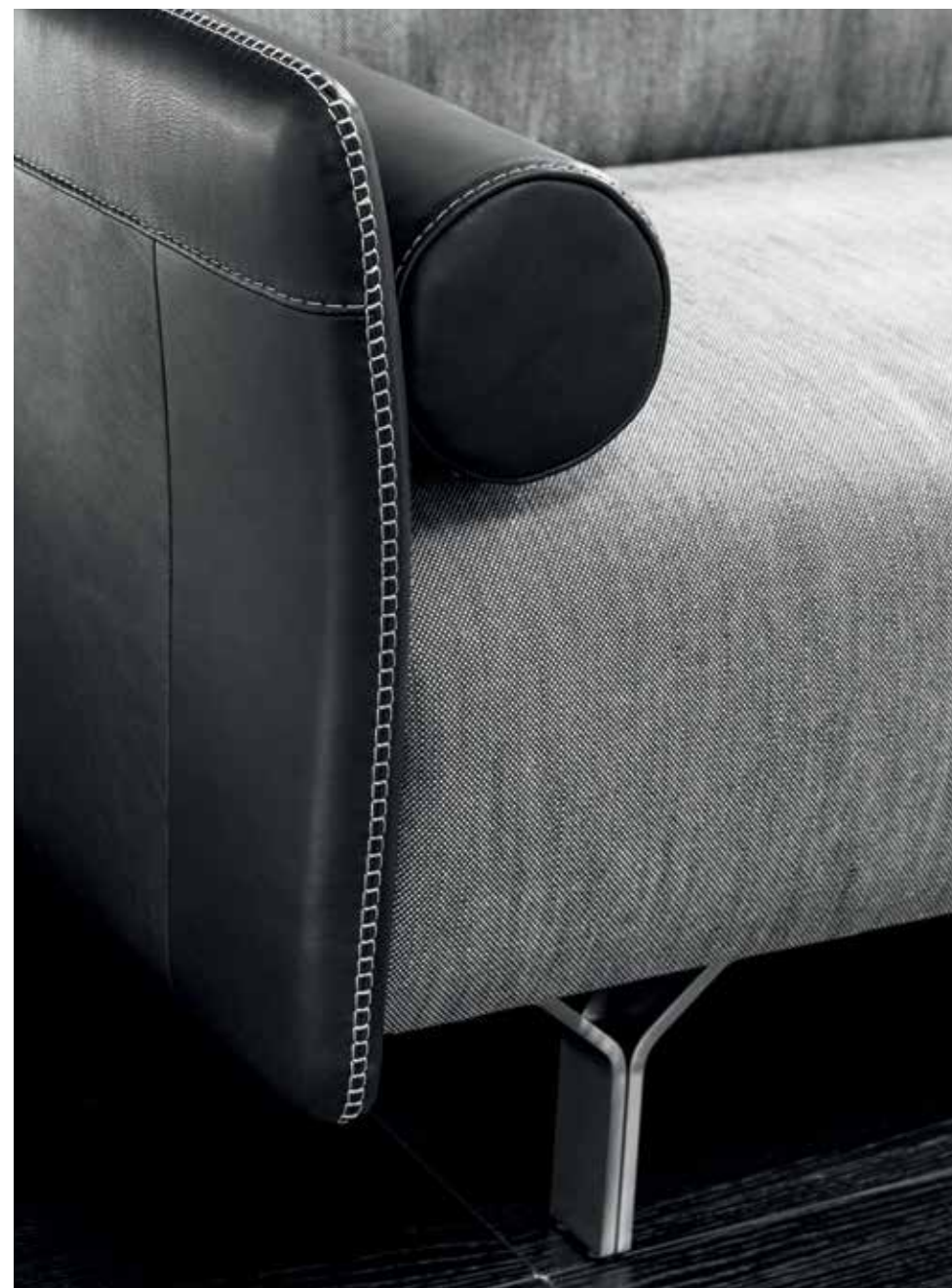
Photo in the previous page: Tenore 3 seater sofa in fabric and leather. Figaro glass table. Museo leather rug. Astra stand lamp.

Photo in this page: Tenore sofa, armrest detail.