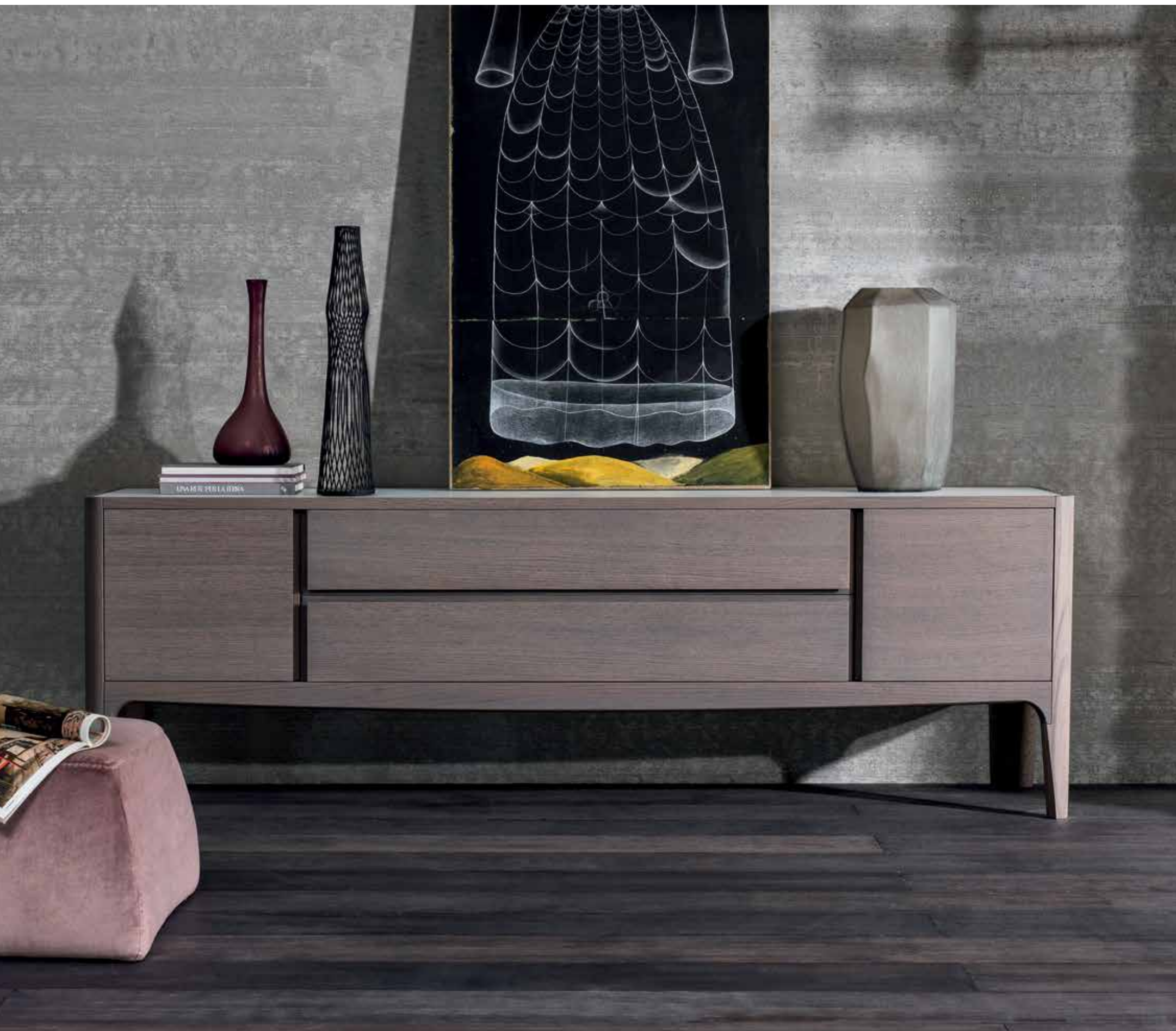
Photo in this page: Fortuna sideboard, designed by Claudio Bellini.

The Fortuna sideboard has a weight-bearing structural frame and legs in solid European oak. Rag-applied finishes, achieved through a handmade process, are available in grey European oak veneer lacquered internally in opaque grey or smoked oak lacquered internally in coffee. Damping systems for drawers and tempered glass top with scratch-resistant acid etched effect, with extra-light back-etching for the milk white finish, or floating glass for the coffee finish.