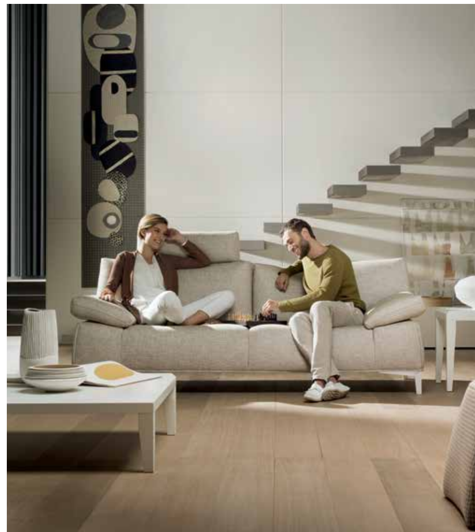
Photo in the previous page: Accento 3 seater sofa in fabric. Platea armchair in leather. Opera central table. Novecento wall unit and sideboard. Bis ottoman. Astra abatjour. Bacco rug.

Photo in this page: Accento sofa, detail of the armrest.