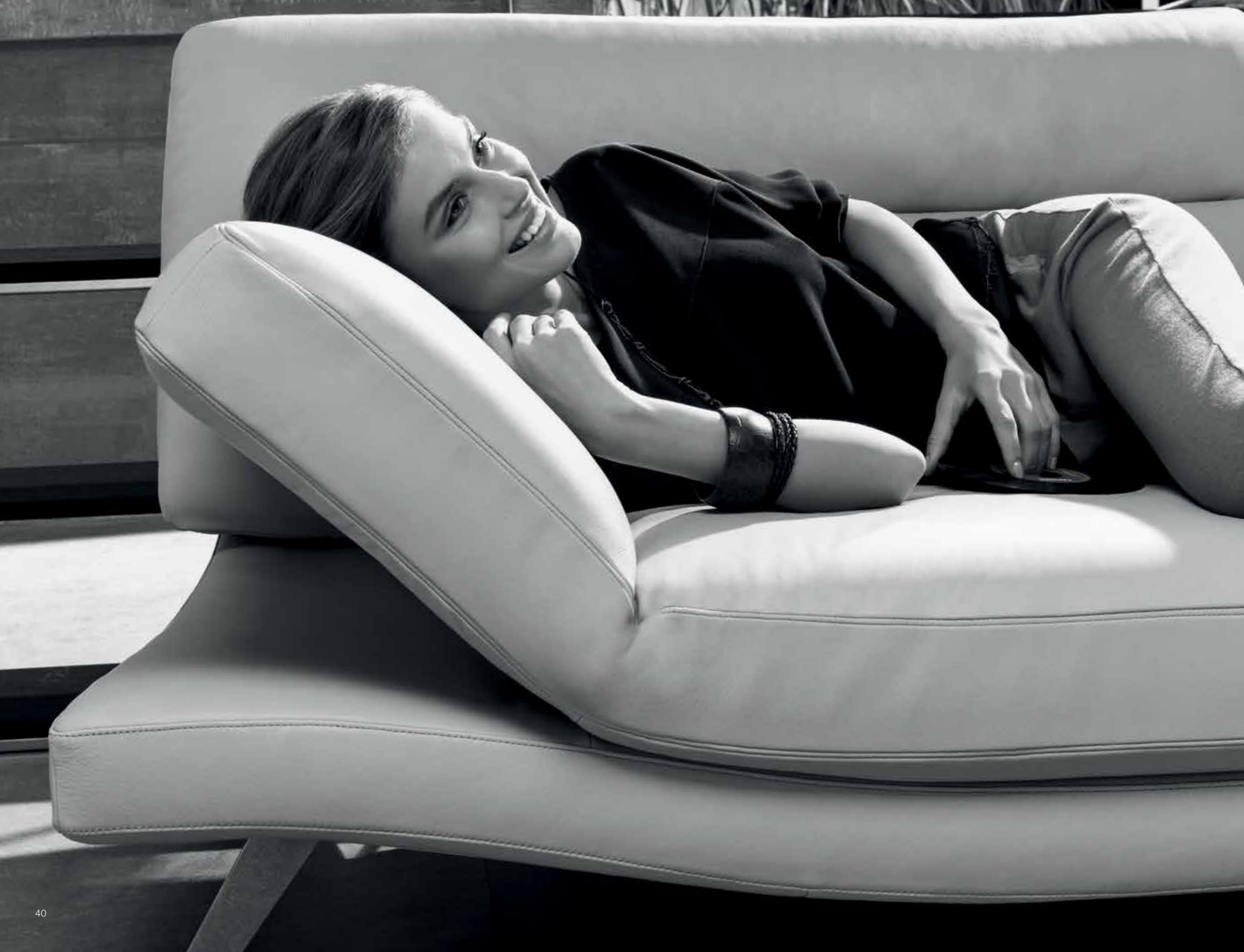
Photo in the previous page: Respiro 3 seater sofa in leather. Novecento wall unit. Gemma table lamp. Cabaret central table and console-bookcase. Cosmo table lamp. Bacco rug.

Photo in this page: Respiro sofa, detail of the armrest.