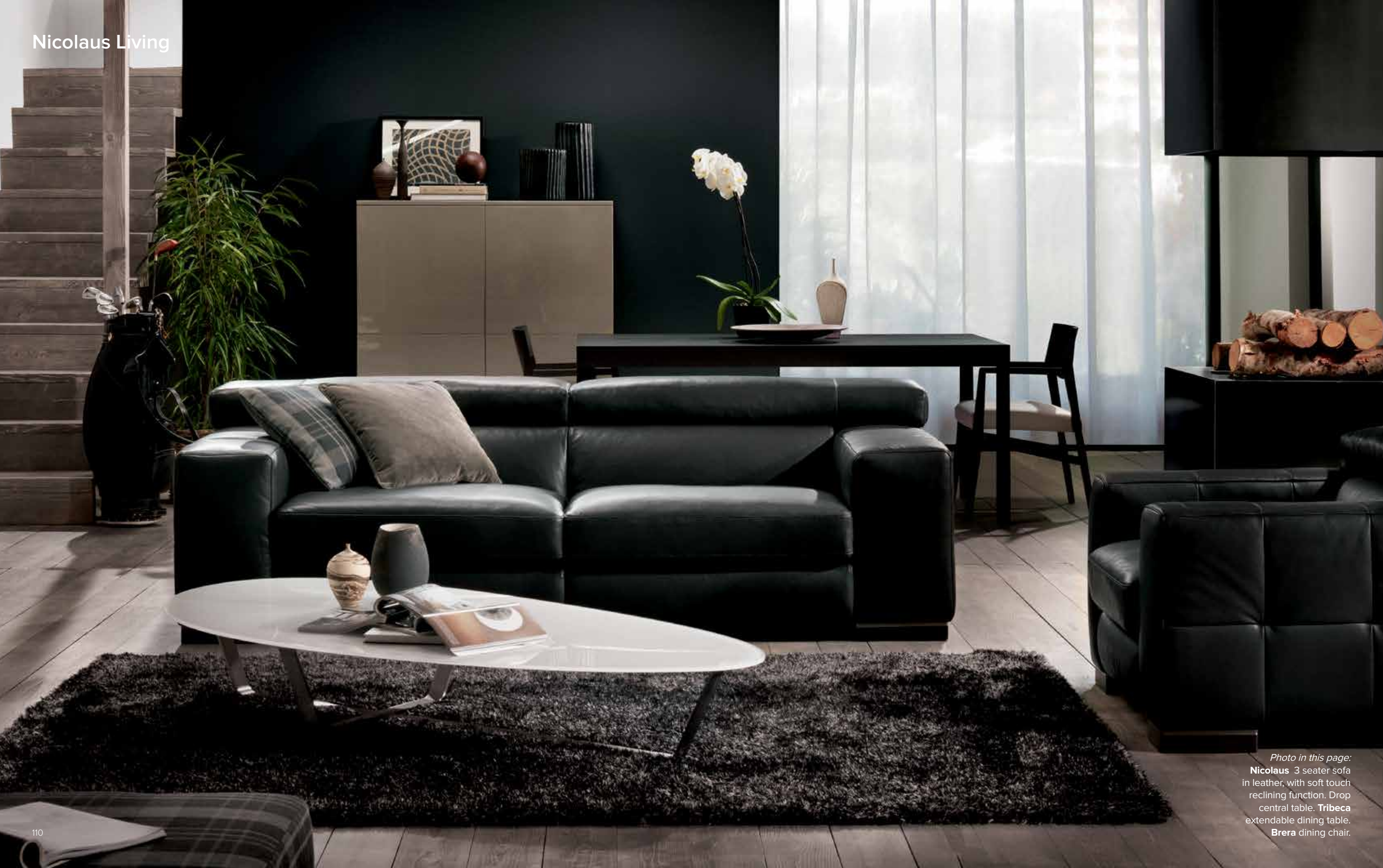
Photo in this page: Nicolaus 3 seater sofa in leather, with soft touch reclining function. Drop central table. Tribeca extendable dining table. Brera dining chair.