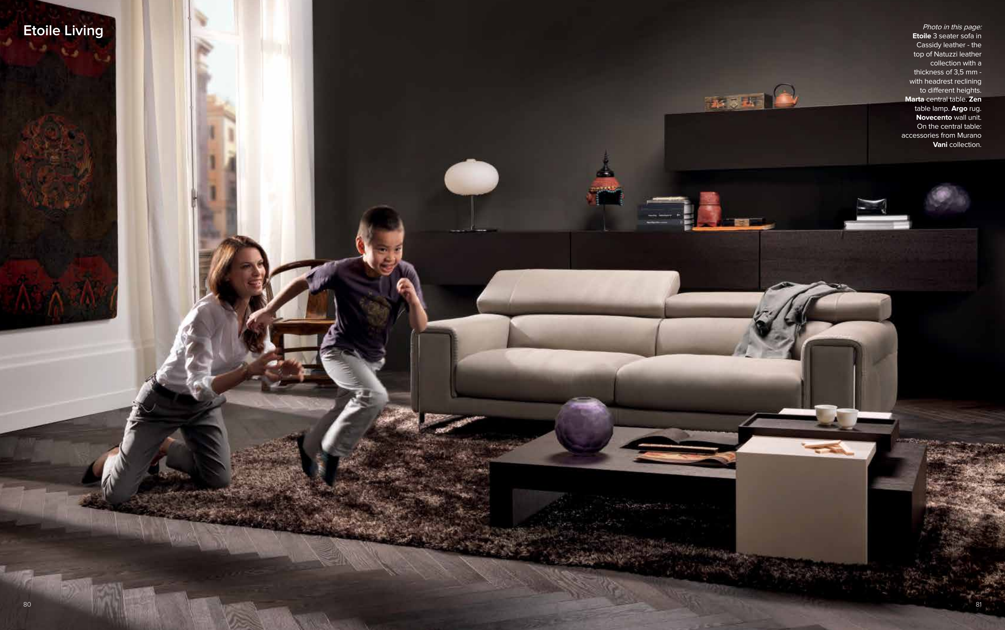
Photo in this page: Etoile 3 seater sofa in Cassidy leather - the top of Natuzzi leather collection with a thickness of 3,5 mm - with headrest reclining to different heights. Marta central table. Zen table lamp. Argo rug. Novecento wall unit. On the central table: accessories from Murano Vani collection.