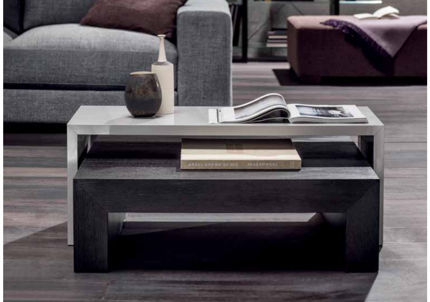
Photos in this page: Scattered pillow. Giasone rug. Marta central table.