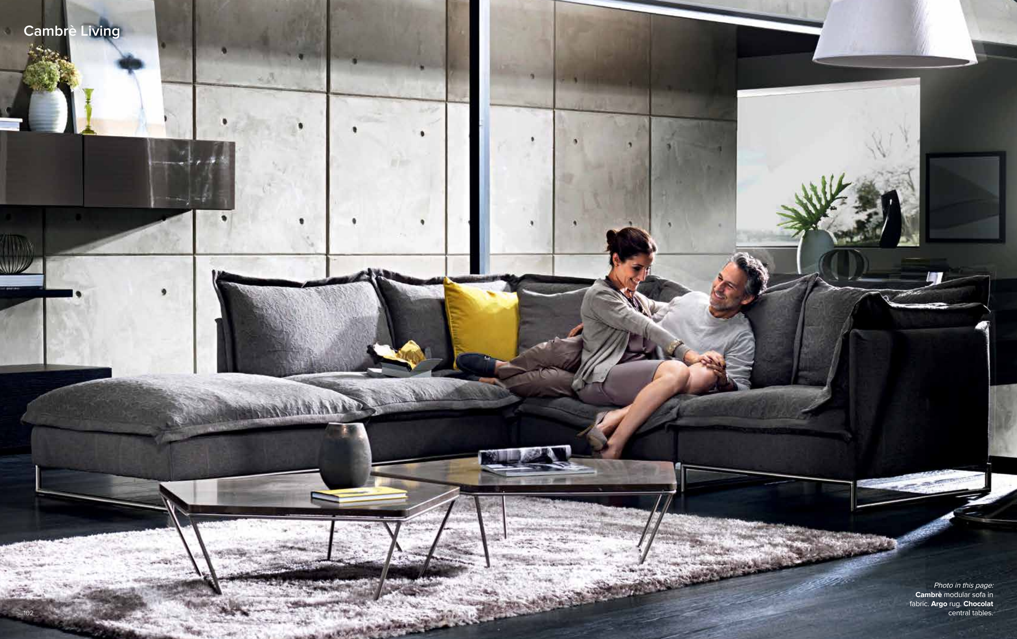
Photo in this page: Cambrè modular sofa in fabric. Argo rug. Chocolat central tables.