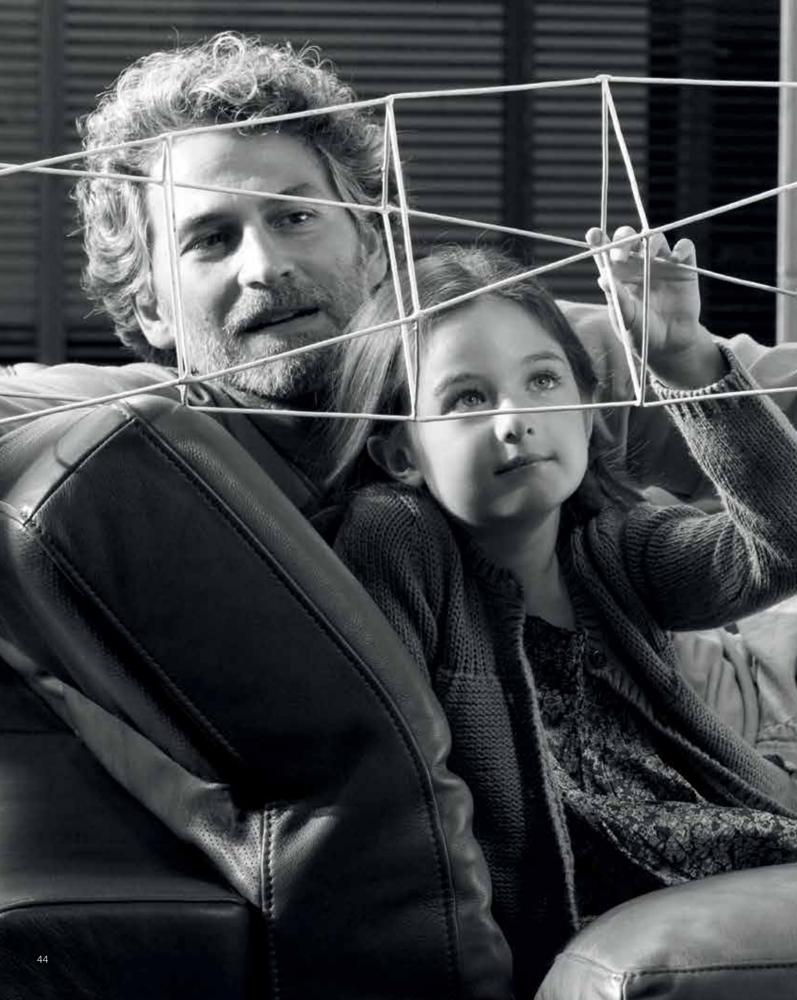
Photo in the previous page: Metaphora modular sofa in leather, with adjustable headrest. Cabaret central table. Gordon table lamp. Sideboard from Novecento collection.

Photo in this page: Metaphora sofa, detail of the adjustable headrest.