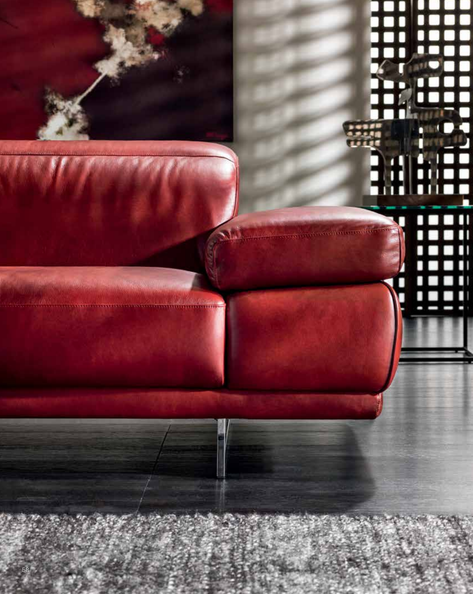
Photo in the previous page: Preludio modular sofa in leather, with headrest and armrest reclining to different heights. Novecento wall unit. Chocolat central table. Martini floor lamp. Bacco rug. Regia chair. On the central table: Cubistic glass vases and candle holder.

Photos in this page: Preludio 3 seater sofa in leather, detail. Giasone rug.