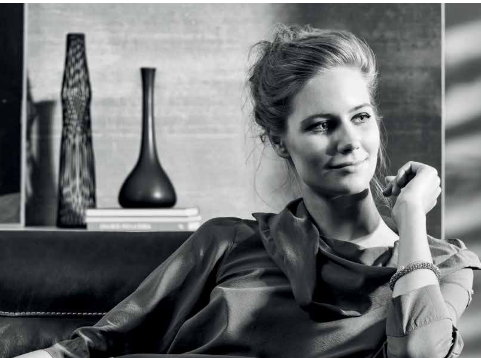
Photo in the previous and this page: Tenore 3 seater sofa in leather with chaise longue. Marlene armchair and Ginger and Grace side tables designed by Paola Navone. Bis ottoman. Cabaret coffee table. Wisdom floor lamp. Giasone rug. On the central table: Cubistic glass vases.

Tenore is a compact size sofa that still offers ample space for sitting. The moccasin stitch details on the arms are an extra touch that can be done tone on tone or highlighted using a contrasting colour. It comes with an optional headrest for added comfort and decorative cushions and bolsters that highlight the urban style of this product. Design by Studio Tapinassi & Manzoni.