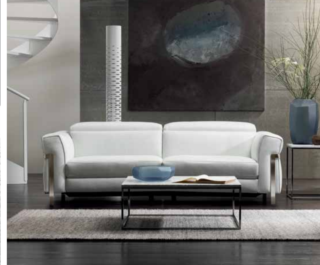
Photo in the previous page: Bolero 3 seater sofa in leather with soft touch reclining function. Cabaret coffee table in Carrara marble. Cosmo floor lamp. Giasone Rug. On the central table: Cubistic glass vase.

Photo in this page: Bolero 3 seater sofa in white leather.